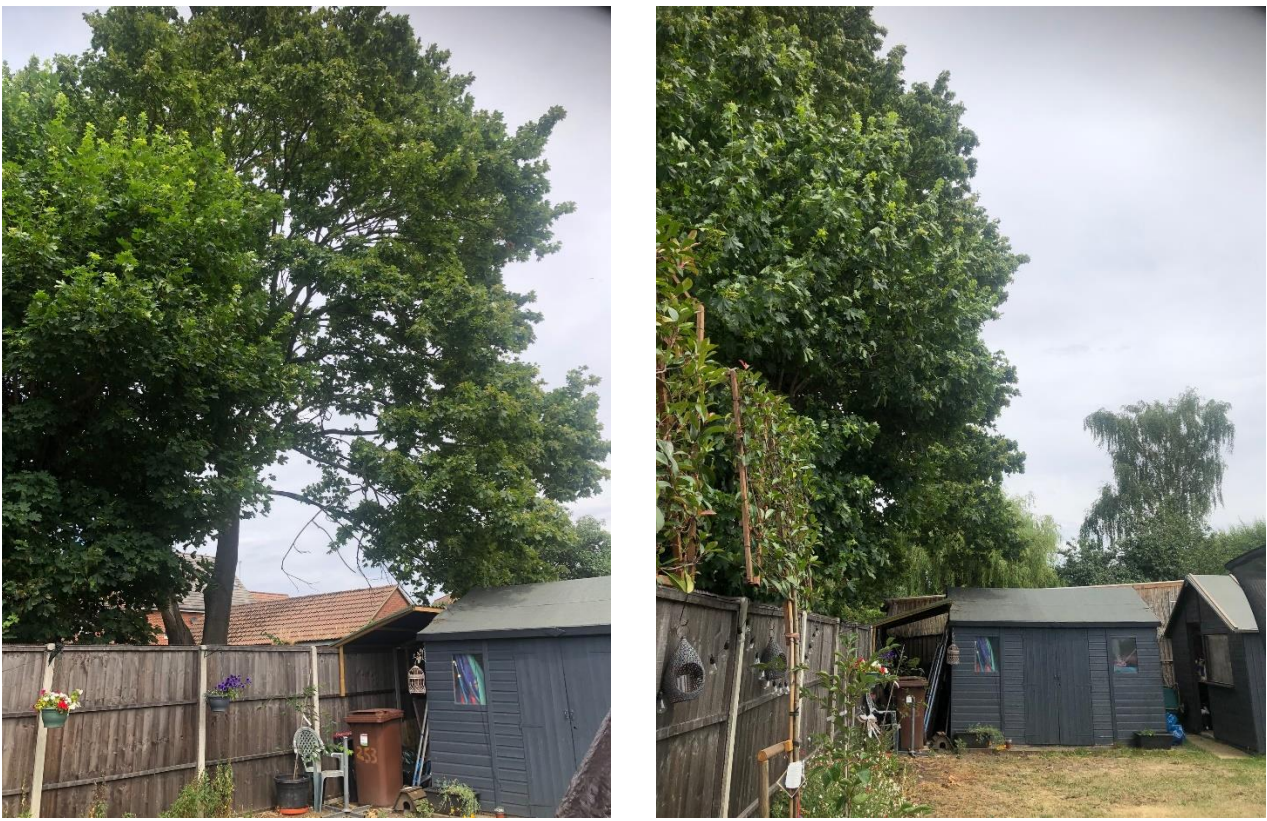
Broken and dead branches often hang on live branches The shed is a 10ft wide, to give some scale on the overhanging branches