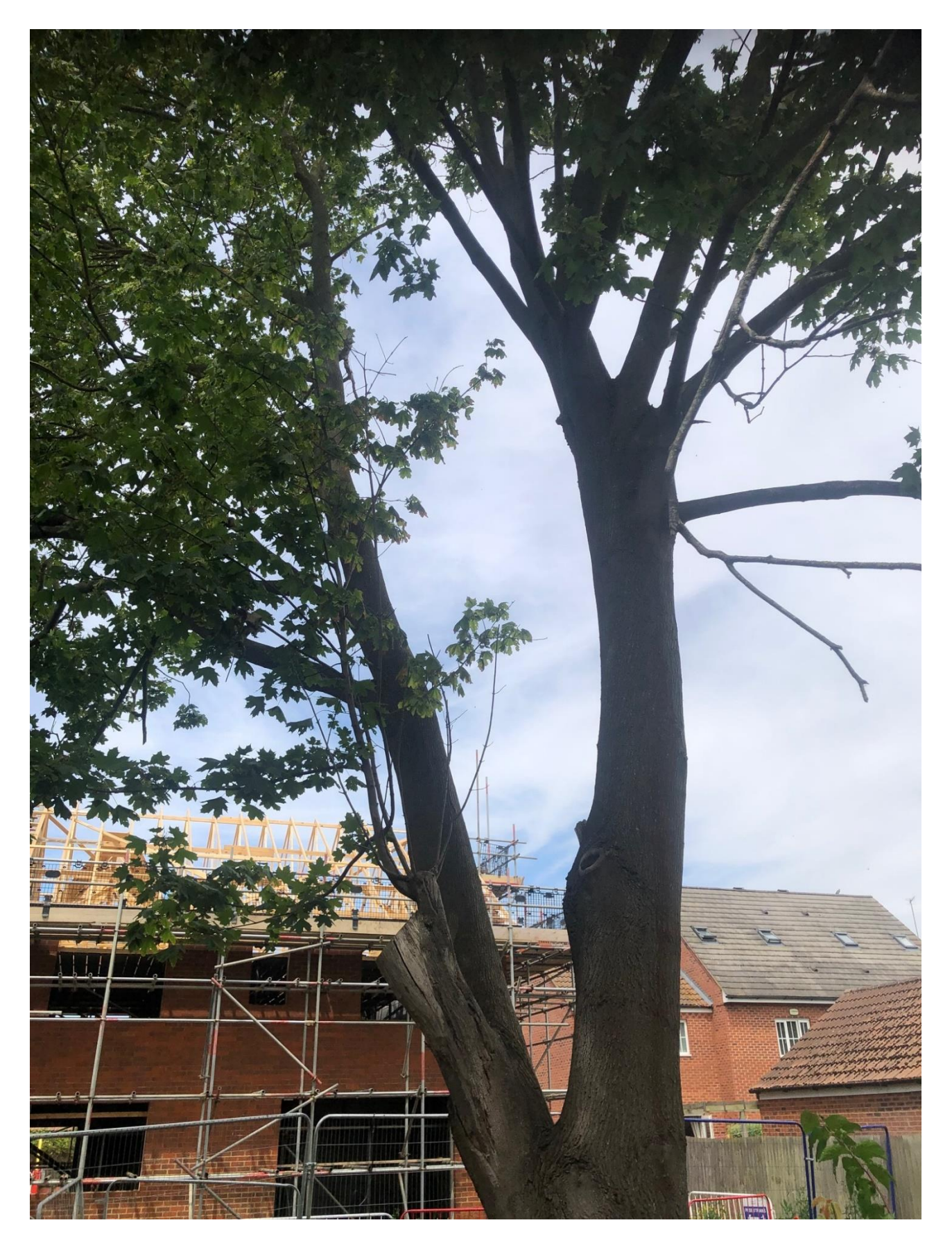
The largest tree, I couldn't get a good picture full size but this would be around 50% of the tree height and width.